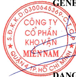
DANG VU THANH