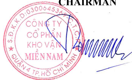
TRAN TUAN ANH